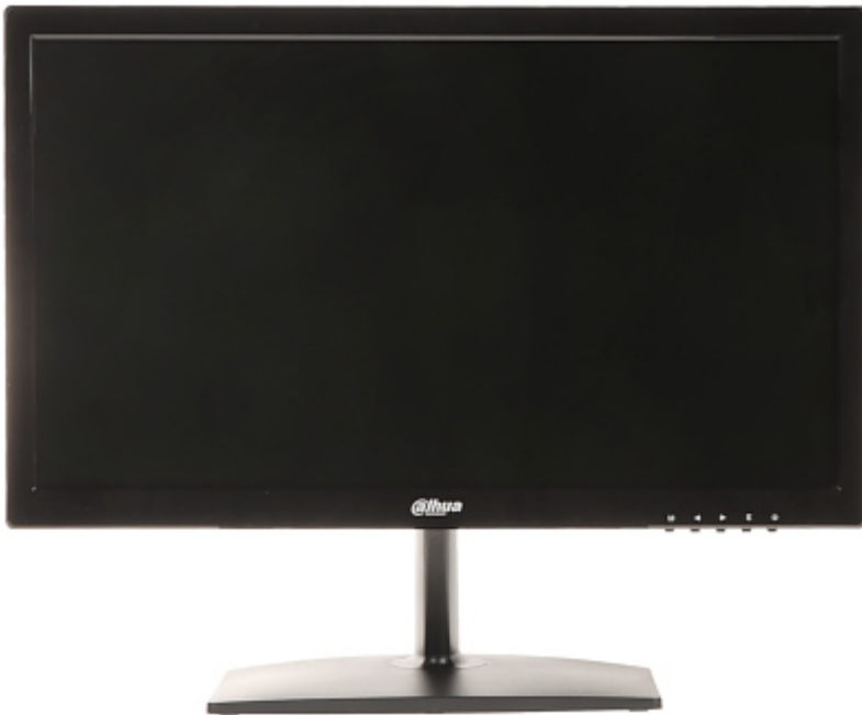
OSD menu control keys: