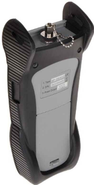
Rear view (place for battery):