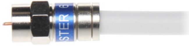
Sectional views of the new and compressed connector on RG-6 cable: