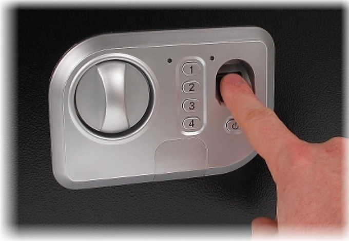
Safe door with 2 locking bolts: