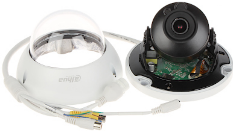
Memory card slot: