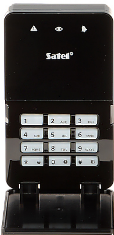
View with closed cover: