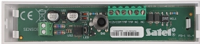
Rear view + additional kit elements: