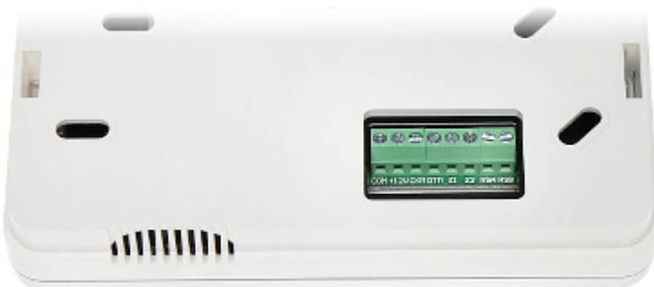
View after remove the cover: