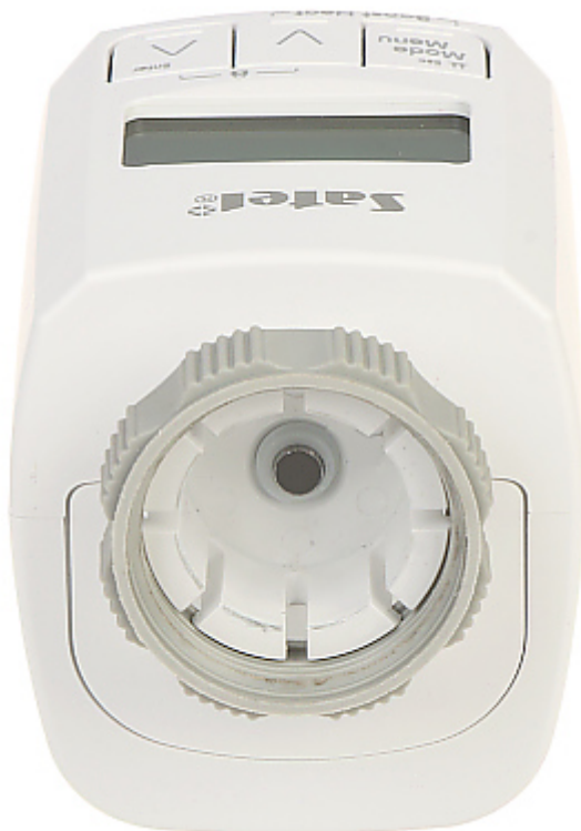
Place for batteries 2 x 1.5V AA: