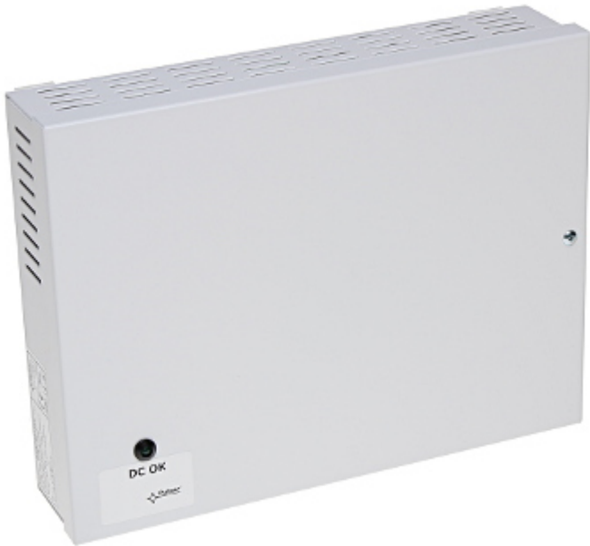
Front panel view: