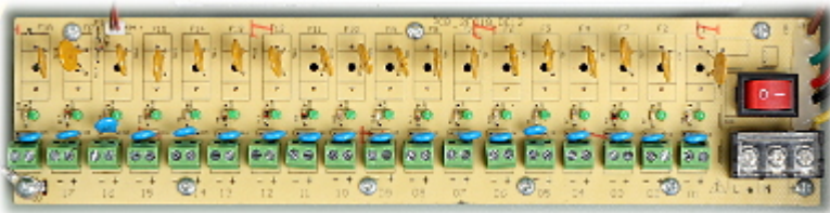
Power adapter view in lockable casing: