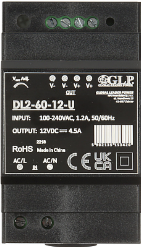
Rear panel (DIN rail installation):