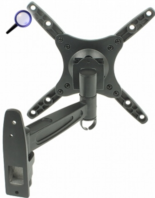
Possibility of mount adjustment: