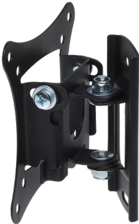
Possibility of mount adjustment: