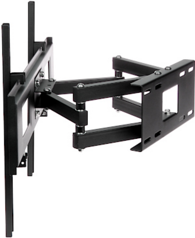
Wall mounting side view: