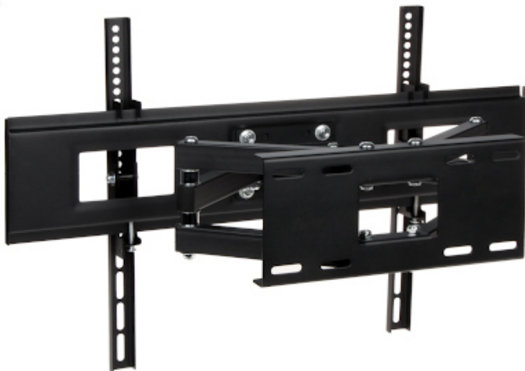
Possibility of mount adjustment: