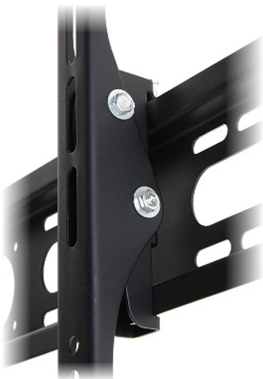
Possibility of mount adjustment: