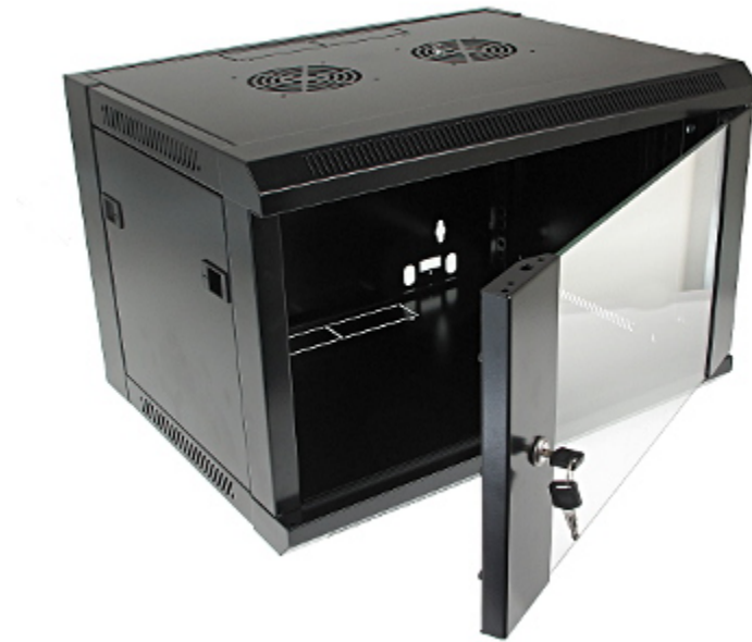
Side view (no mounted sides and back cover):