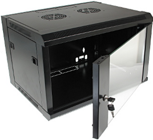
Side view (no mounted sides and back cover):