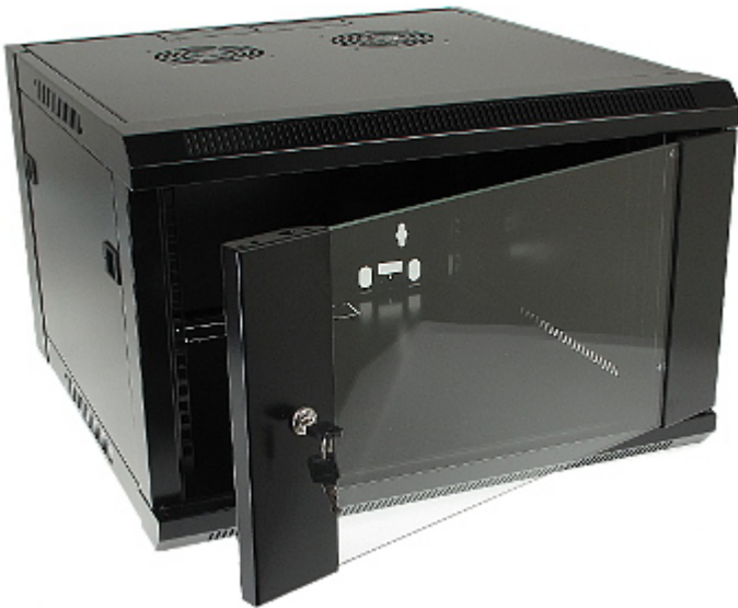
Side view (no mounted sides and back cover):