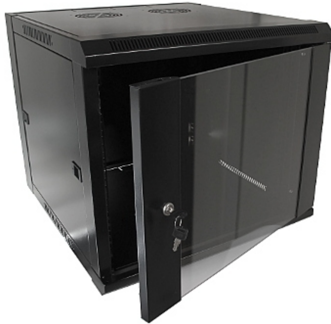
Side view (no mounted sides and back cover):