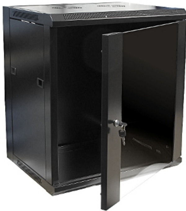
Side view (no mounted sides and back cover):