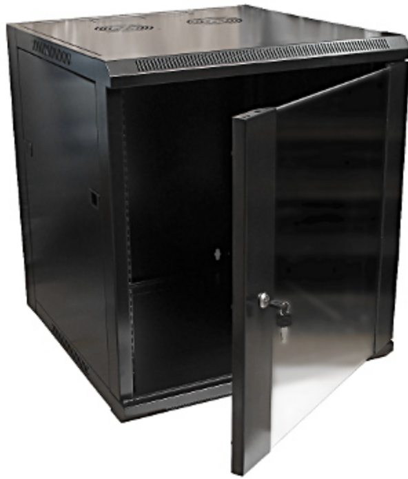
Side view (no mounted sides and back cover):