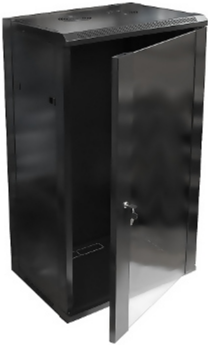
Side view (no mounted sides and back cover):