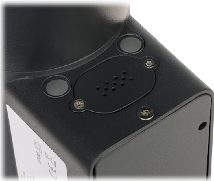
Memory card slot and "Reset" button: