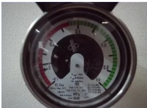
In the kit: