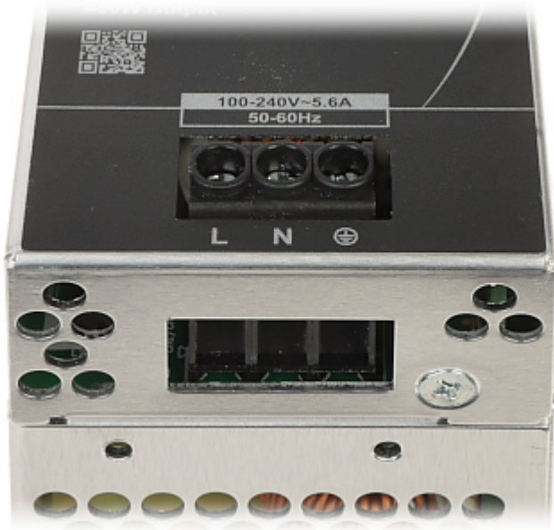
Rear panel (DIN rail installation):