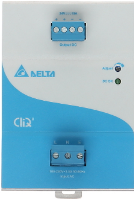
Rear panel (DIN rail installation):