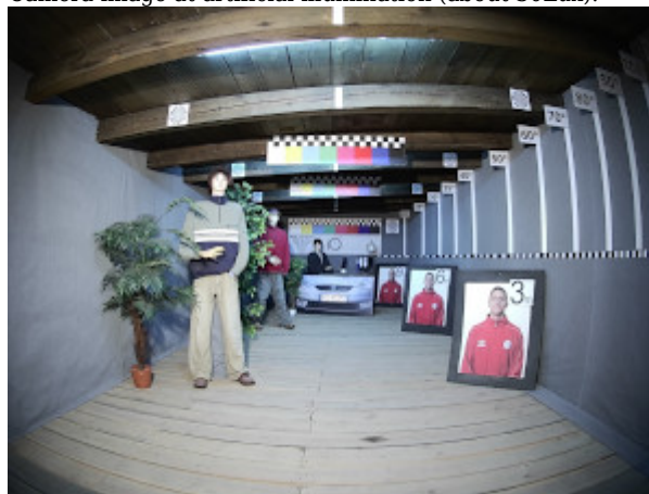
Camera image at artificial illumination (about 30Lux):