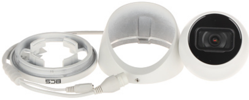
Memory card slot: