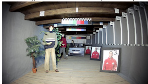
Camera image at artificial illumination (about 30Lux):