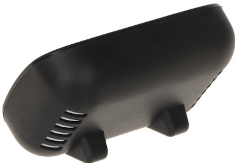
The device is secured with a silicone case, which also serves as a stand: