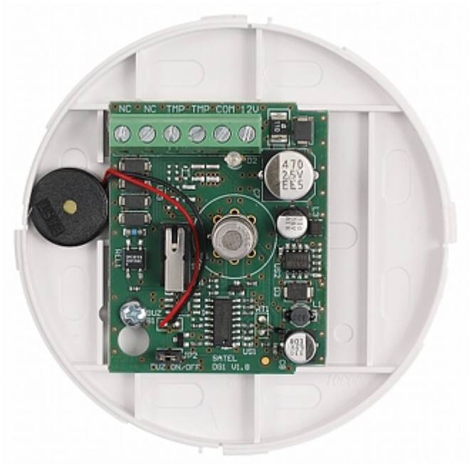
Rear view + additional kit elements: