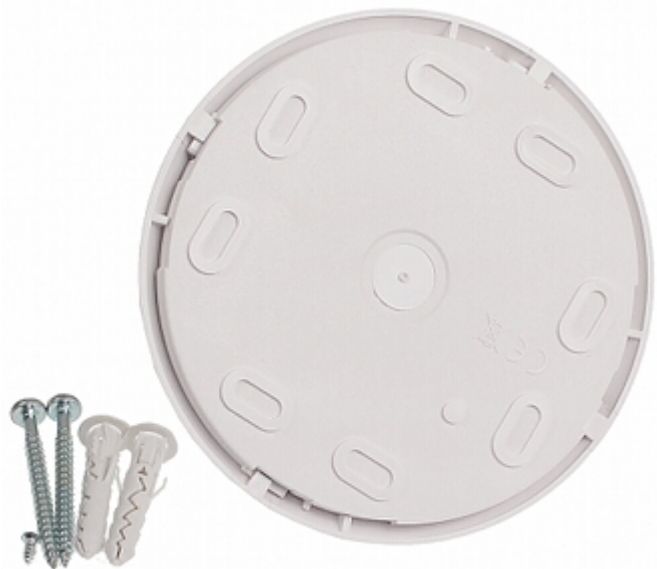
Description of particular elements of the device: