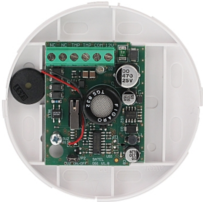
Rear view + additional kit elements: