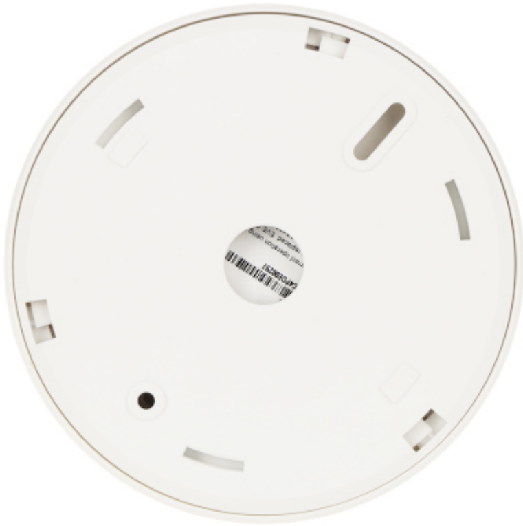
Internal view of the housing: