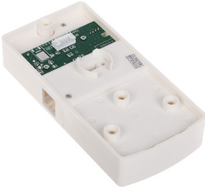
Emergency power supply module: