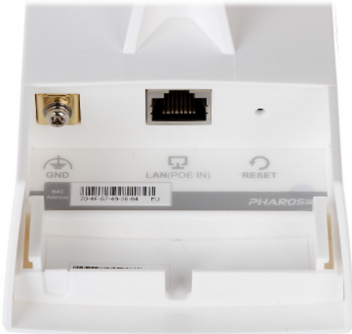
PoE Power Supply and Adapter: