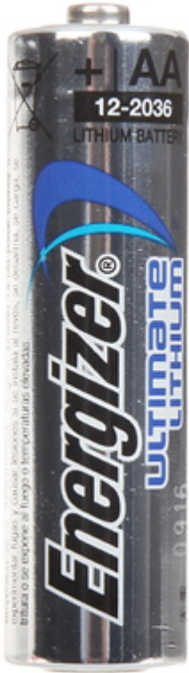
Comparison of Lithium and Alkaline batteries capacity: