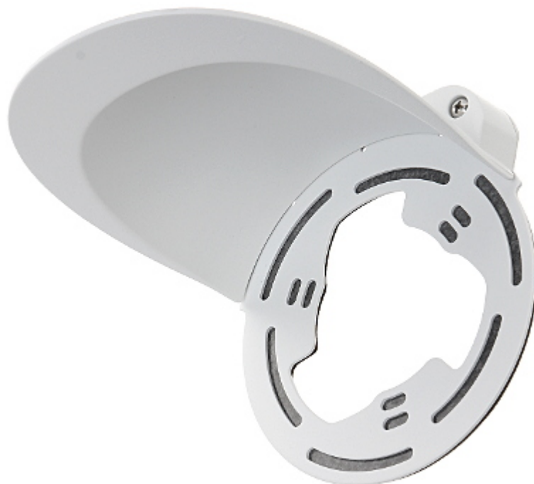
Rainproof housing for DAHUA dome cameras.

The device must be secured against contact with caustic, staining and viscous fluids.