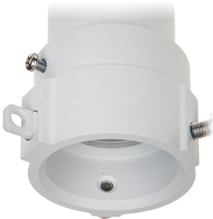
View of the ceiling mounting side: