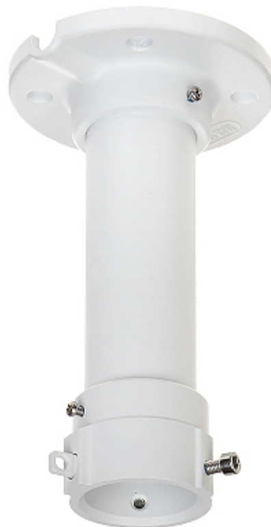
Ceiling bracket for cameras. Bracket has cable entry.

The device must be secured against contact with caustic, staining and viscous fluids.