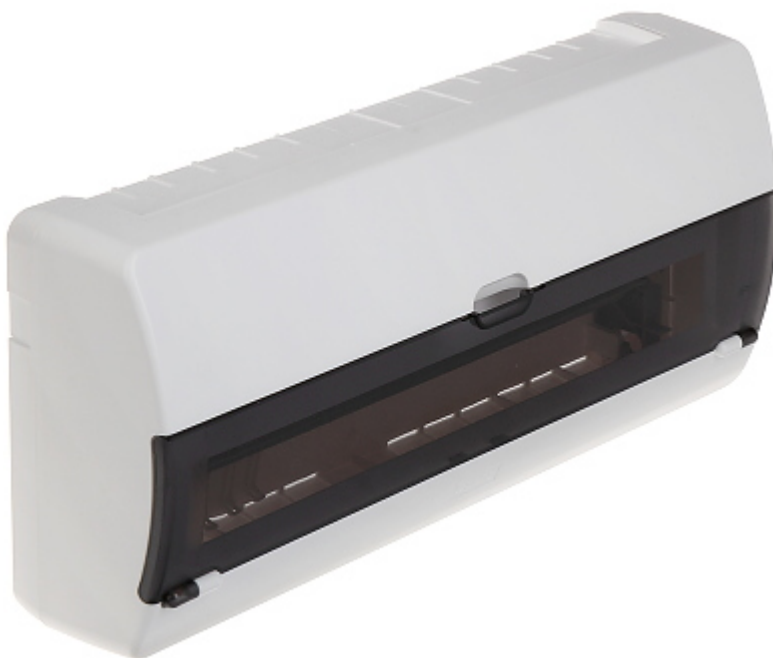
1-row 22-modular surface-mounting distribution electric cabinet.

The device must be secured against contact with caustic, staining and viscous fluids.