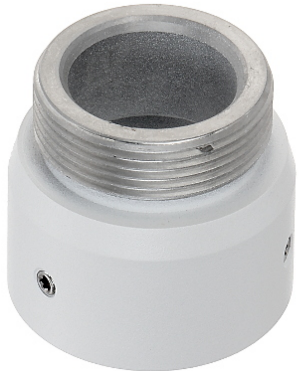
Bracket connecting the Speed Dome type camera to the adapter or other Dahua / BCS thread bracket.

The device must be secured against contact with caustic, staining and viscous fluids.