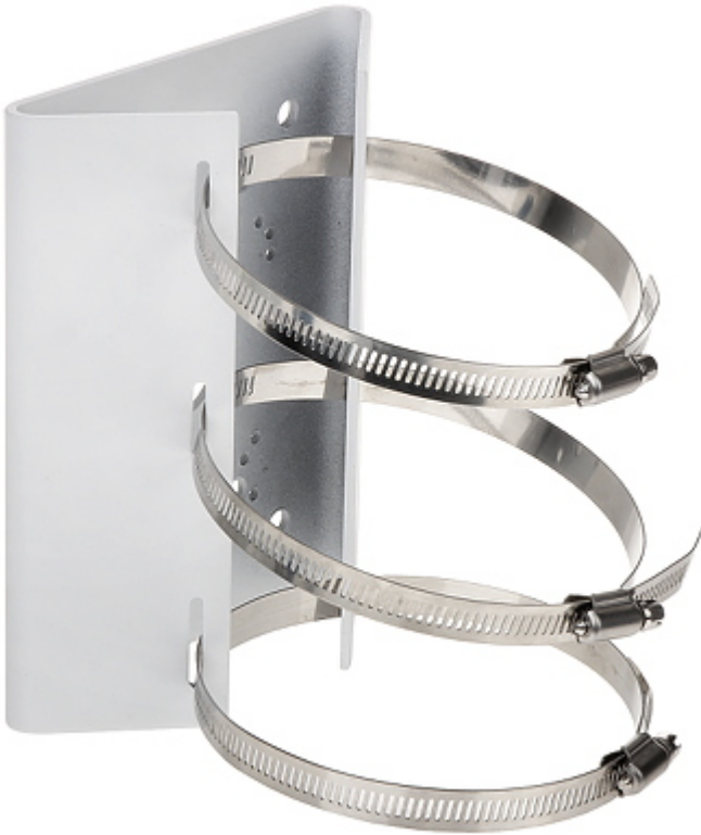
Top view - clamping strips diameters range: