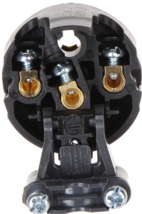
Cable mounting side view: