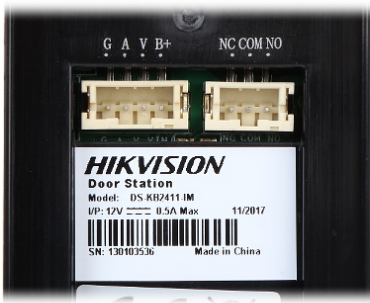
INDOOR PANEL: Front view: