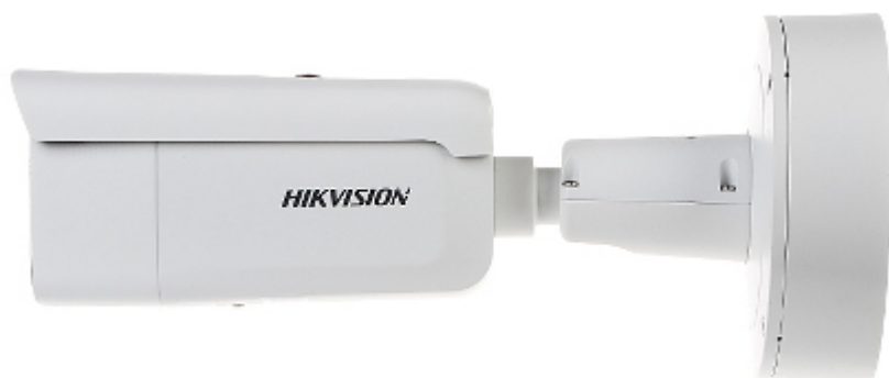
Memory card slot: