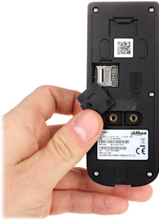
Wi-Fi chime module: