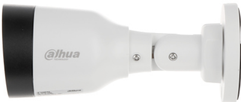
Camera mounting side view: