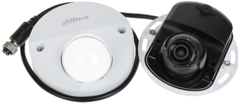
CVBS, SPOT output: