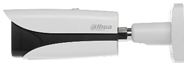
Wall mounting side view: