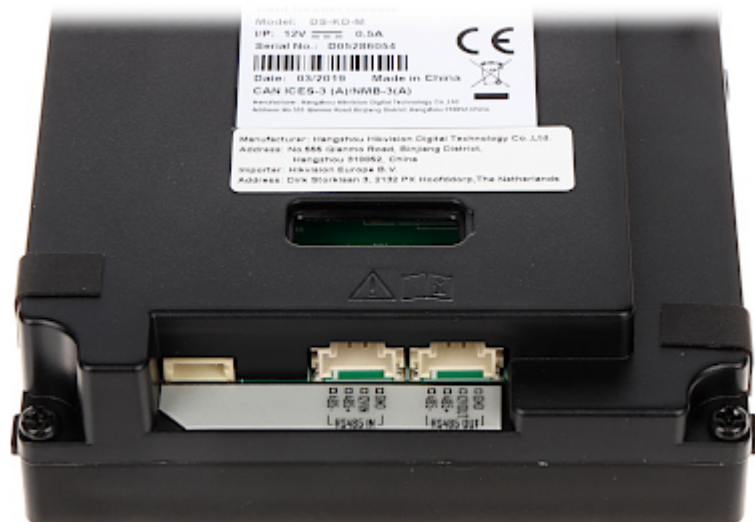
Example of application: