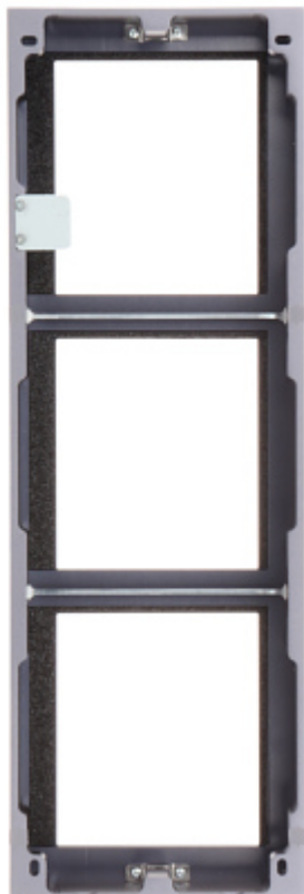
View after removing the front panel: